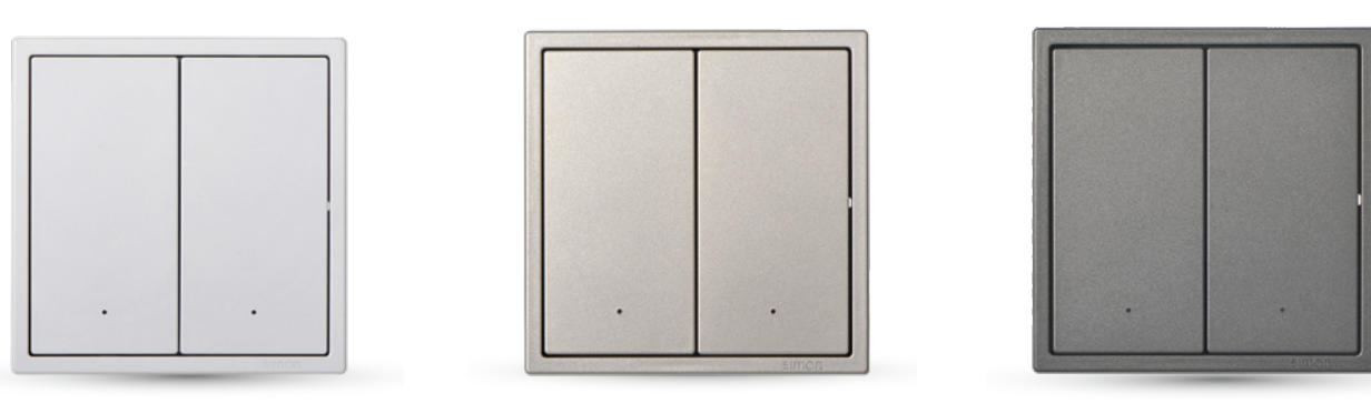
70E902 2 gang smart KNX switch module(21 \sim 30V DC)