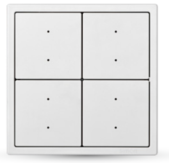
70E905 8 gang smart KNX switch