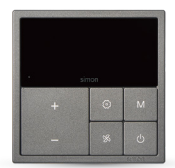
70E7034 All-in-one smart KNX AC thermostat controller