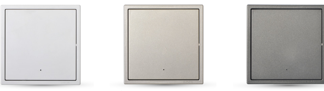
70E901 1 gang smart KNX switch module(21~30V DC)