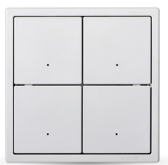
70E904 4 gang smart KNX switch