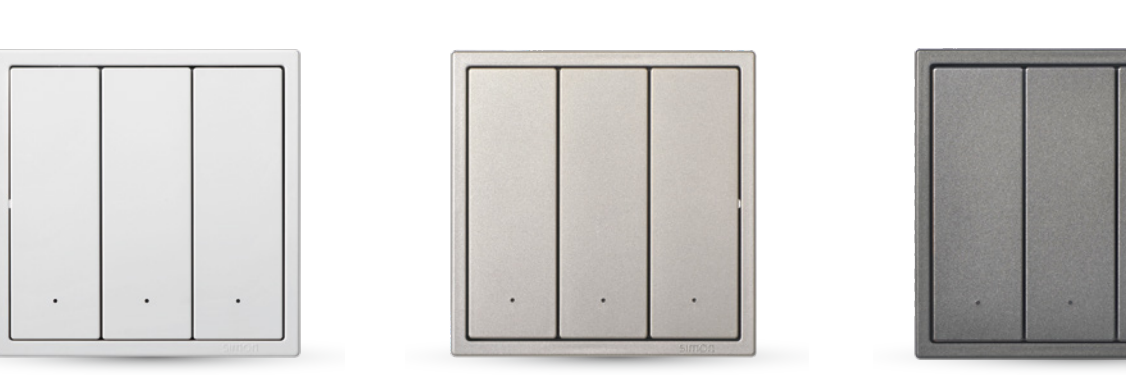
70E903 3 gang smart KNX switch module(24DC)